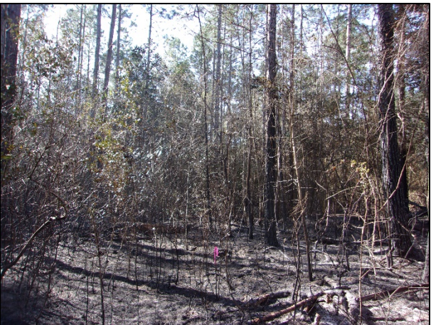
153 acre first entry prescribed burn in Hardin County.