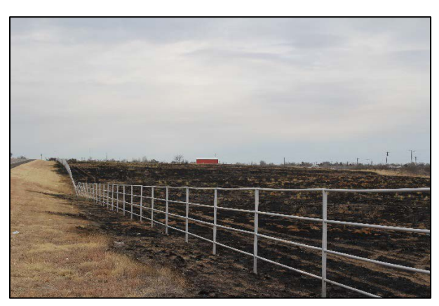
41 acre rangeland fuel reduction treatment bordering Stinnett, TX in Hutchinson County.