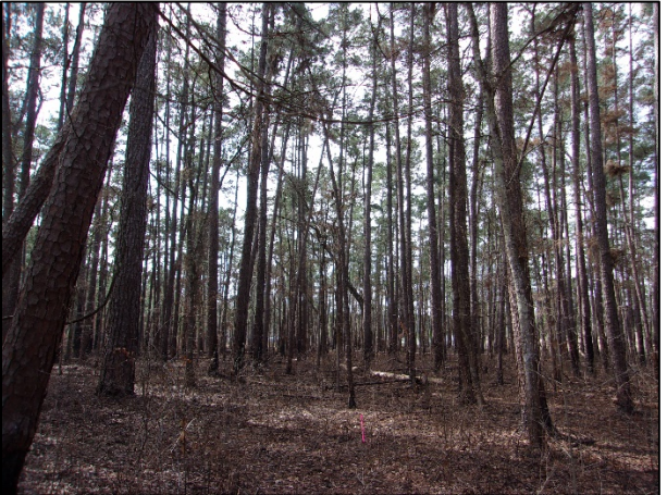
147 acre prescribed burn to maintain understory of loblolly pine stand in Montgomery County.